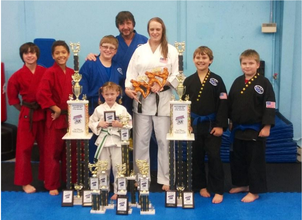
Competitors from 2014!