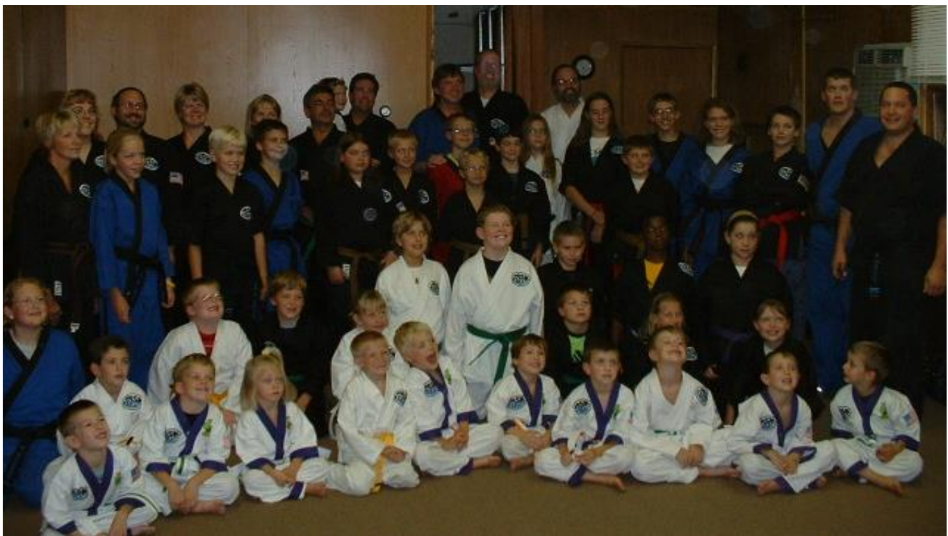
The last class at our first location, Fall 2004!